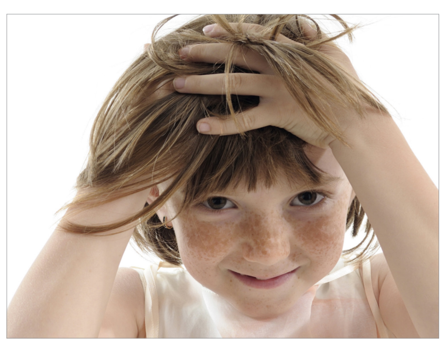
Head\ lice\ can\ be\ a\ common\ problem\ in\ childhood\ and\ difficult\ to\ treat

Hatchtech will retain global rights for non-human applications of the lotion, as well as the right to commercialise the product for humans in territories outside of its agreement with Dr Reddy's.